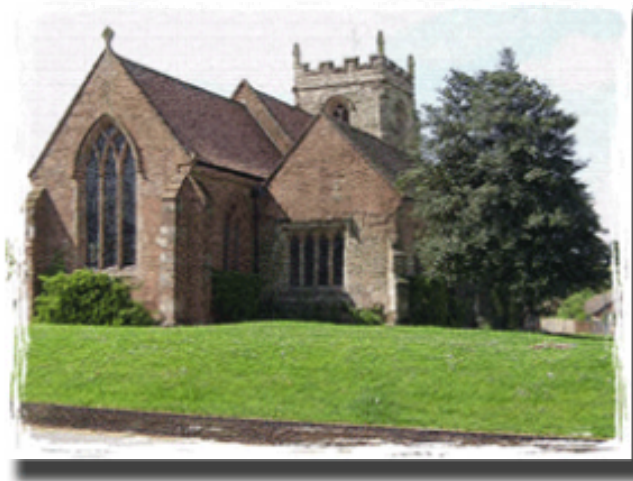
St. Mary the Virgin, Walsgrave