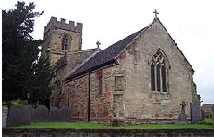
St. Andrew's church Shilton